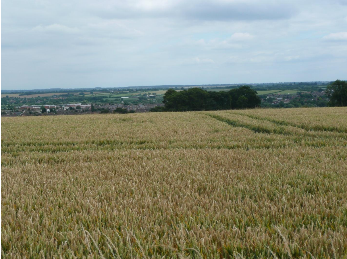
East Leake nestling in a natural hollow, as seen from the bridleway between Rushcliffe Golf Course and West Leake