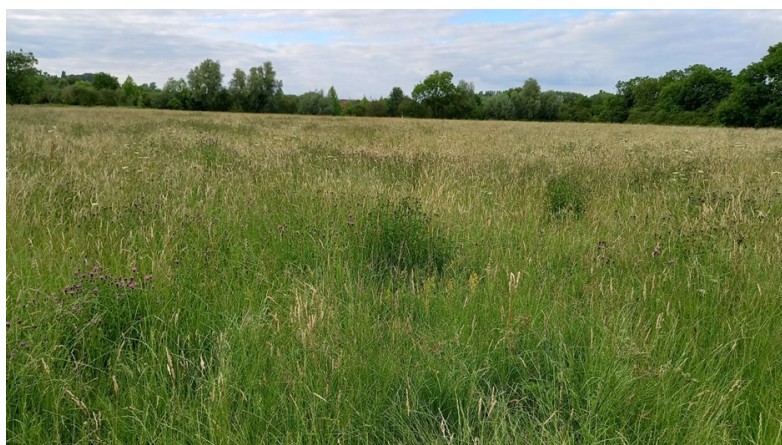
Meadow Park looking lush

Councillor Jason Billin Convenor – Climate Action East Leake