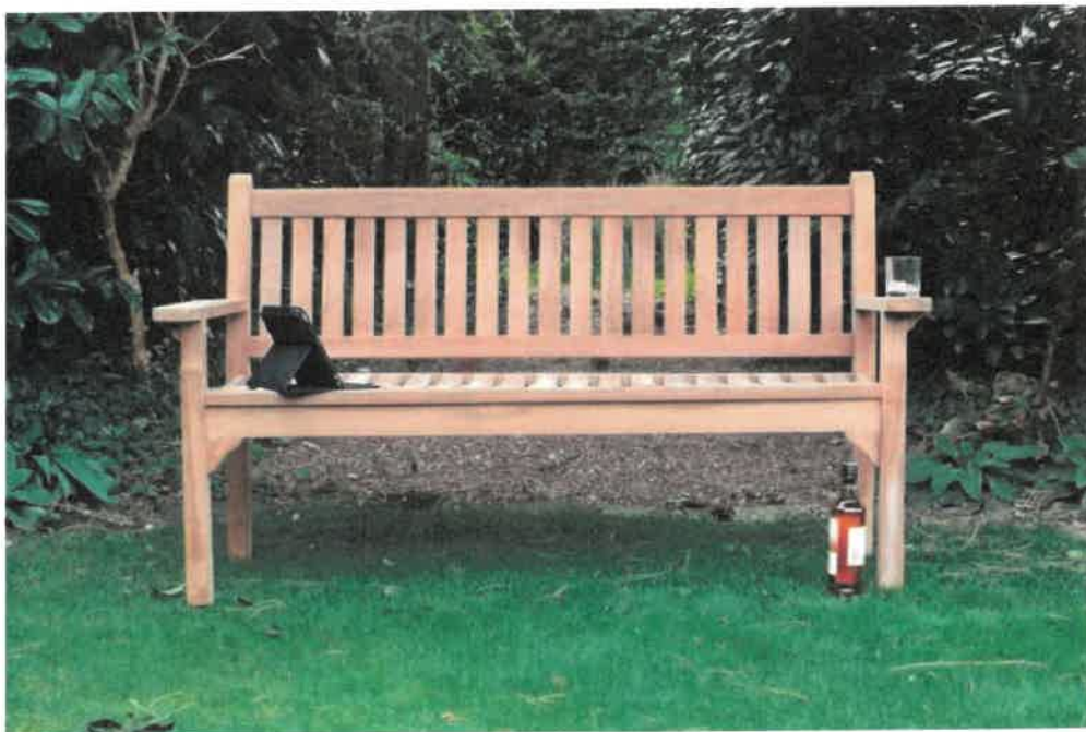
Westminster Flat Arm Teak Bench 3-Seater (£299.00)