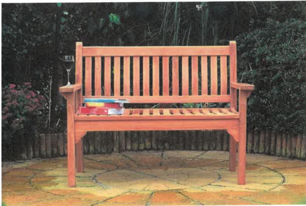
Westminster Flat Arm Teak Bench 2-Seater (£249.00)